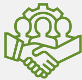
Project & Construction Management