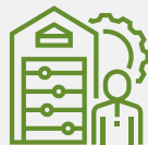
Site And Technical Construction Management