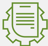
Development Management, Feasibility Studies